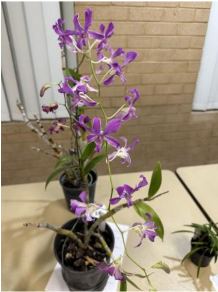
Dendrobium x superbiens