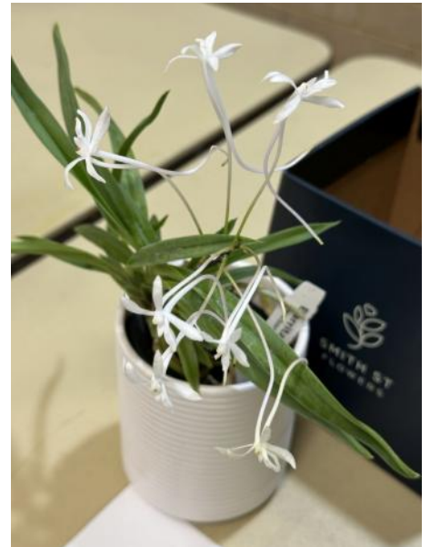
Vanda falcata Diane