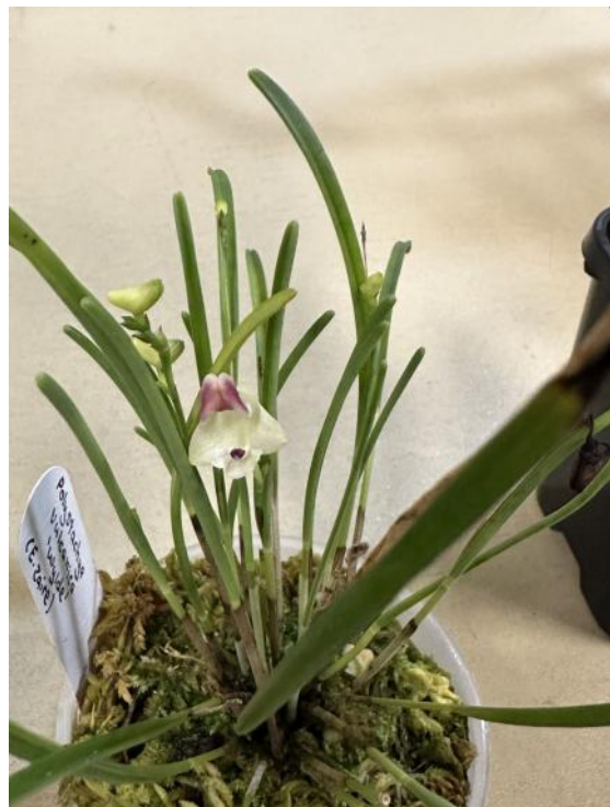
Polystachya vulcanica Ryan