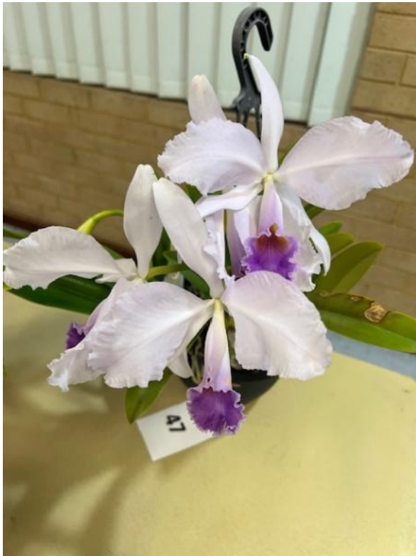
Cattleya trianae Helen