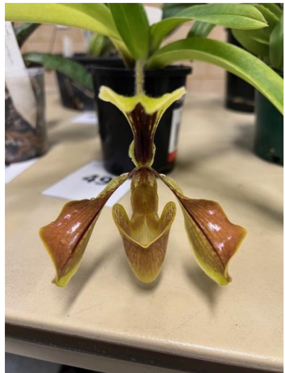
Paphiopedilum villosum Siva