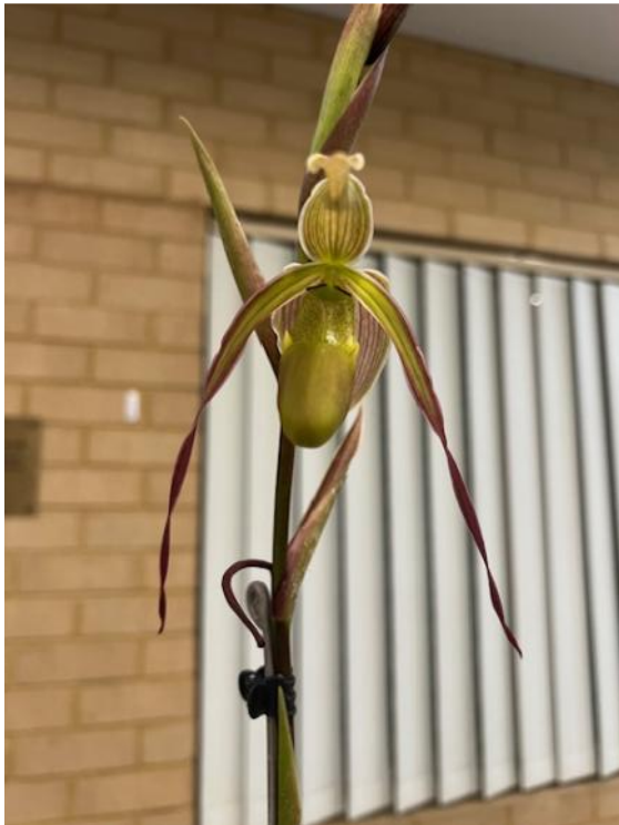
Phragmipedium longifolium Bruce

Paphiopedilum villosum Paphiopedilum wardii