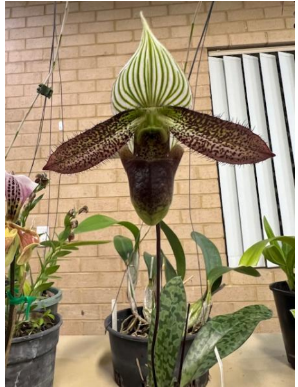
Paphiopedilum wardii Siva