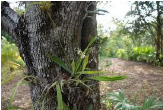
In situ photo: https://travaldo.blogspot.com/2022/03/encyclia-guatemalensis-guatemalan-encyclia-care.html