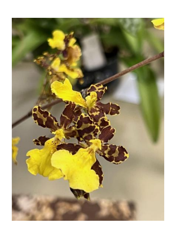
Oncidium tigrinum Murray & Arni