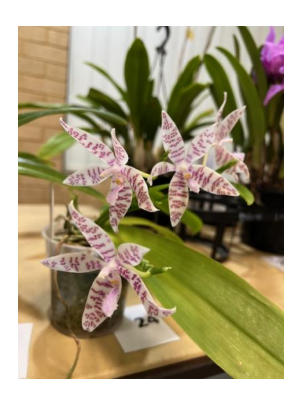
Phalaenopsis heiroglyphica Siva