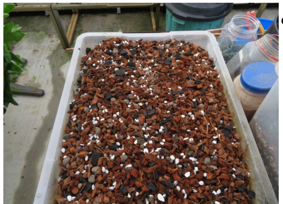
Coir Chip media