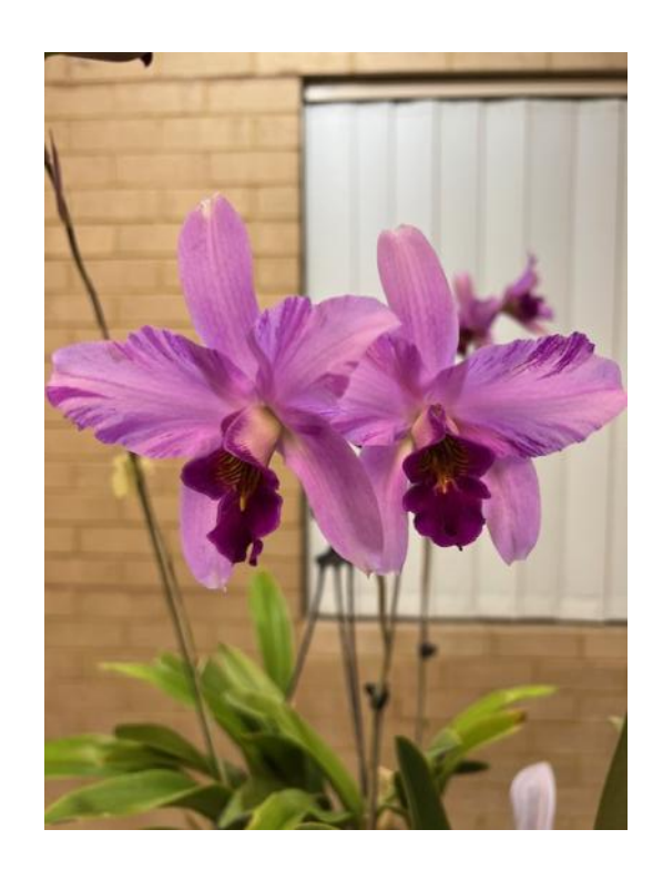
Laelia anceps Bruce