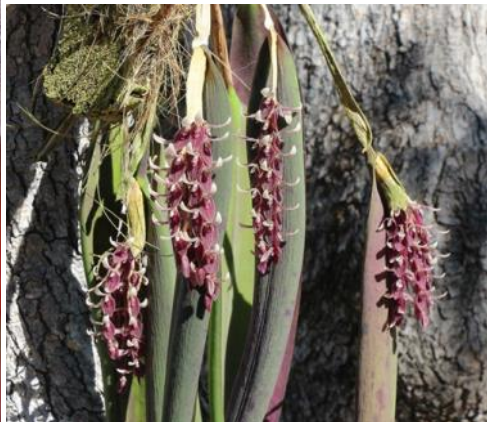
A photo showing growth habit