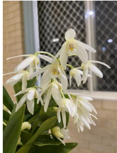
Dendrobium falcorostrum Murray