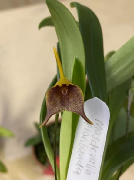
Masdevallia floribunda Harry