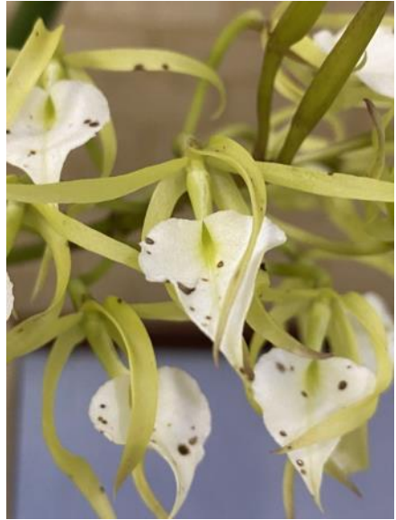
Brassavola harrisii Harry