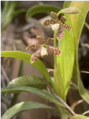
Prosthechea boothiana