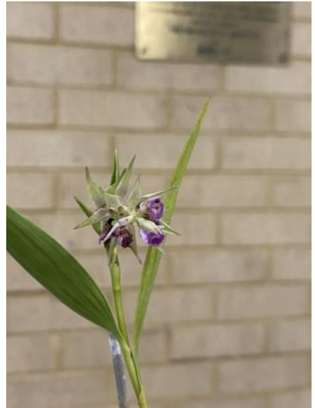
Elleanthus amethystinus