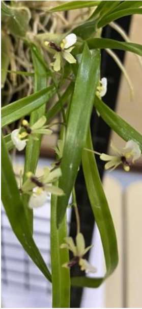
Sigmatostalix radicans Bruce