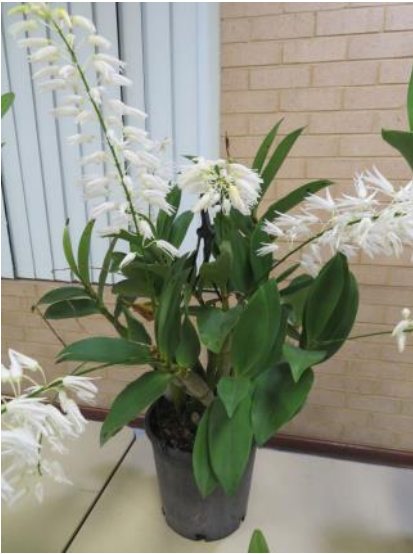
Dendrobium jonesii Harry