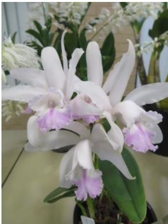
Cattleya intermedia Harry