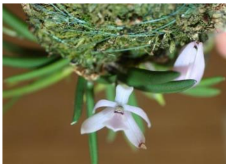
Leptotes unicolor Harry