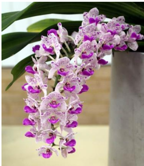
Rhynchostylis retusa Charly