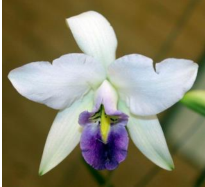
Laelia anceps Graham & Margaret